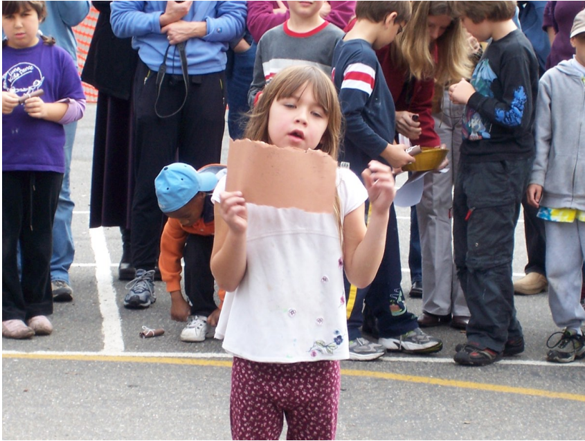
Wishes for Mother Earth.

Here's a brief update regarding enrollment. Our hours are filling up well, and the teachers have been dealing with large groups wandering through their rooms. One week they even had tours two days in a row!