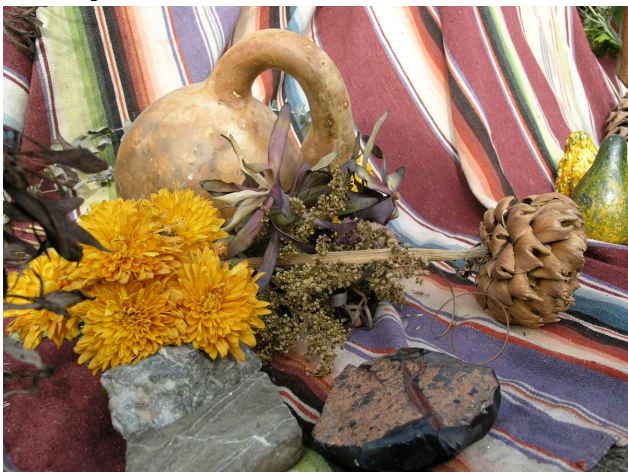
Stone Soup altar.